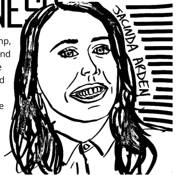
ILLUSTRATION BY RONAN PORTER

It can be so easy to ignore homelessness, thinking "that will never be me", but in reality we may not have control over our housing situations. Anything could happen and if there is no one to help you... At the end of the day we need to look after our fellow humans and show kindness. Not hate.